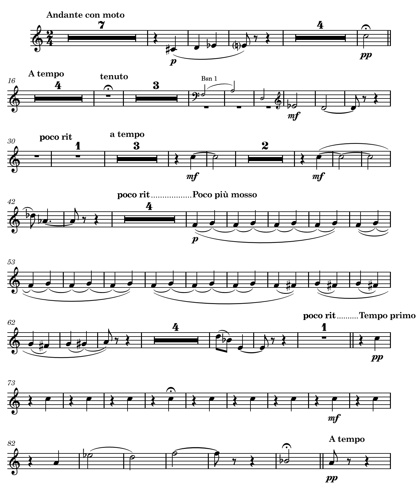
1. Flow 1