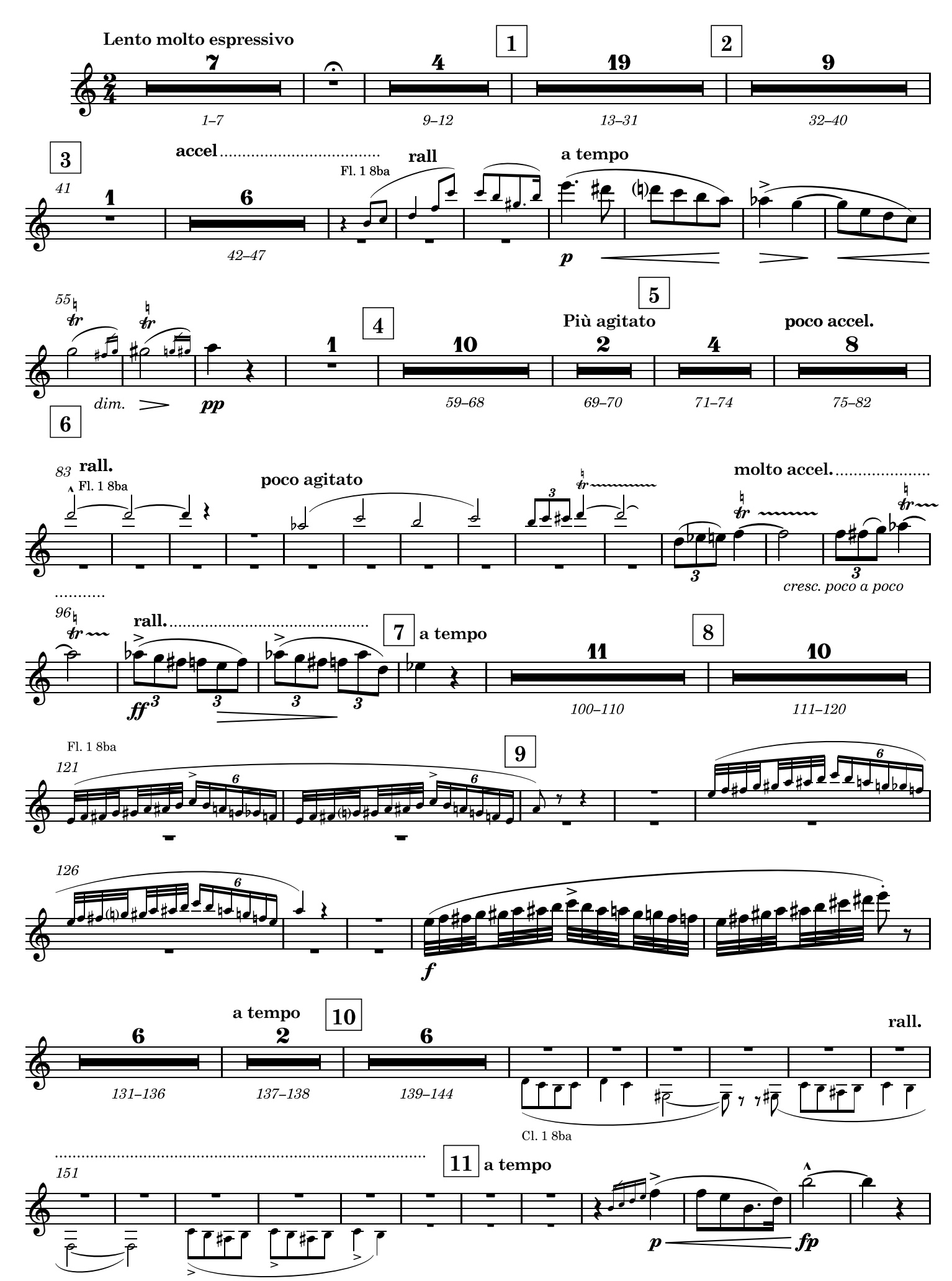
Meg Blane - A Rhapsody of the Sea: Epilogue